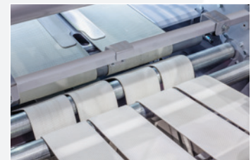
Cross fold EZ-Out