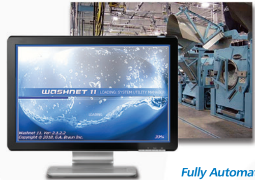
Fully Automated Open Pocket Washer/Extractor System

This promotes less wear on major end components and provides outstanding durability and machine longevity.